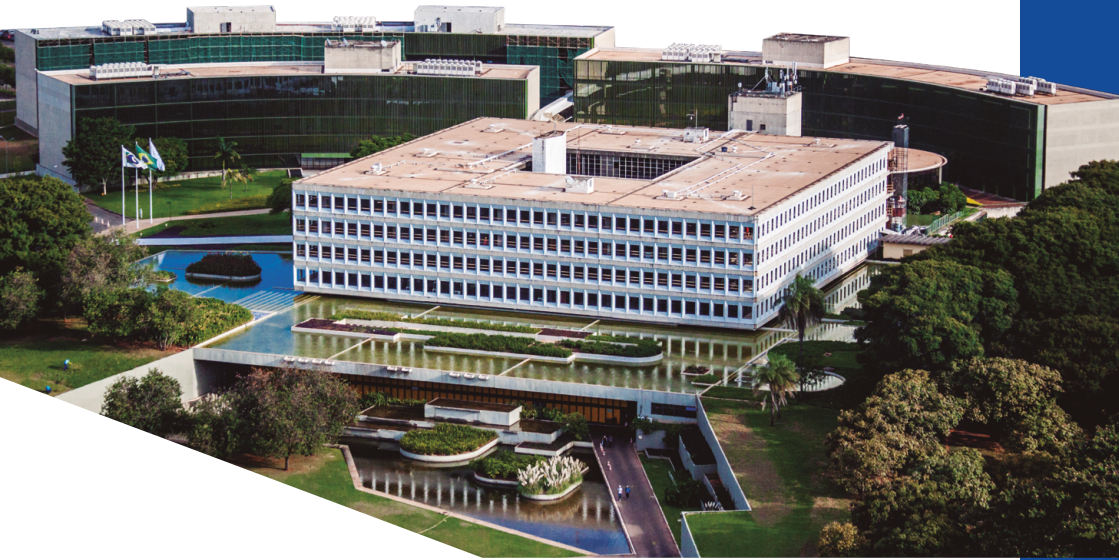
Brazilian Federal Court of Accounts (TCU)